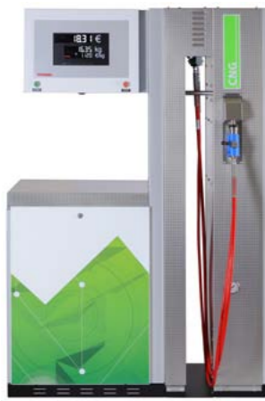
BMP 4000.OE EURO/CNG