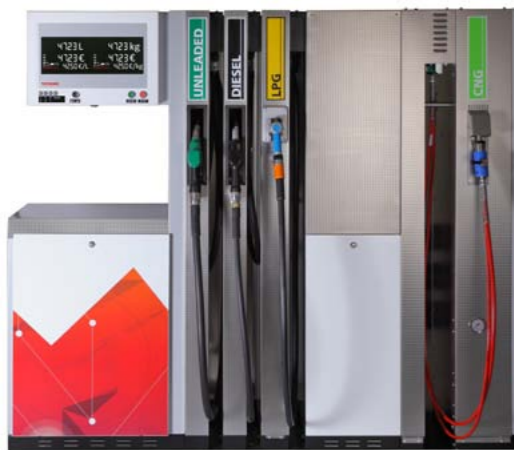
BMP 4000.OE EURO COMBI/CNG

As an experienced global producer with many years' experience with much more than just CNG dispensers, we have created a timeless design that not only meets countless requirements of varied customers, but also offers simple adjustment from a single filling nozzle to up to four nozzles.